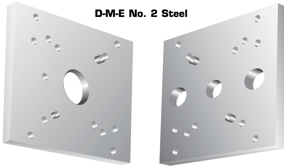
D-M-E No. 2 Steel