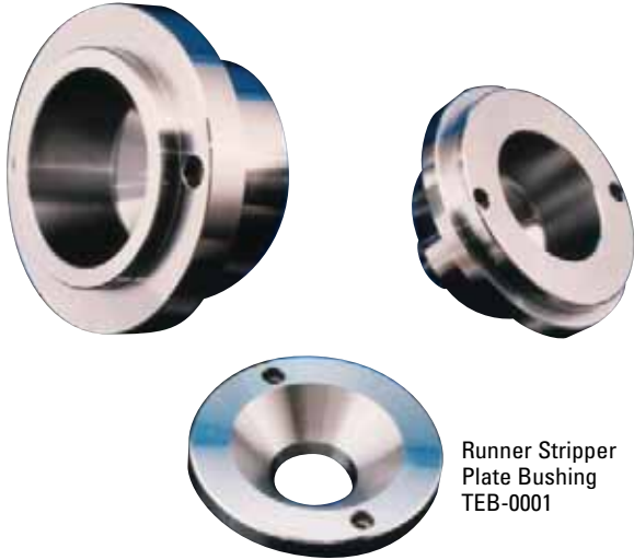
Runner Stripper Plate Bushing TEB-0001